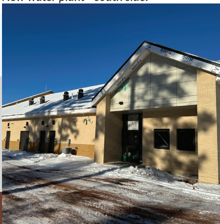
New water plant - south side.