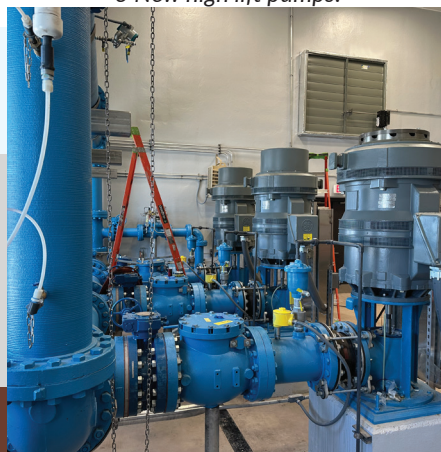
3 New high lift pumps.